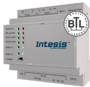
INBACMID004I000 Commercial and VRF 4 Indoor Units