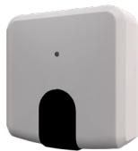
INKNXUNI001I000 Universal IR AC 1 I.U. Binary Inputs