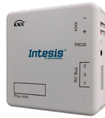
INKNXMID001I000 Commercial and VRF 1/16/64 Indoor Units