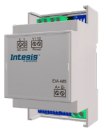
INBMSMID001I000 Commercial and VRF 1/ 4/8/32 Indoor Units