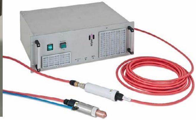
PS2000 high voltage supply with PB3 plasma generator and 10 m drag-chain-compatible HV cable (red) and compressed air connection (blue). CAN bus interface (CANopen slave).